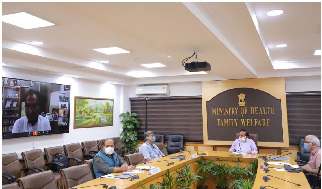
Dr Harsh Vardhan during video conferencing on research and developments initiatives on Covid-19 with the directors of CSIR labs